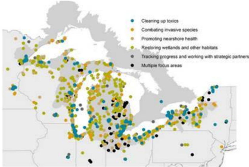
A map showing Great Lakes Restoration Initiative projects from 2010 to 2015. The grant program funds pollution cleanup and habitat restoration projects in the eight Great Lakes states. (U.S. EPA)